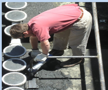
Mauldin Road WWTP Installation